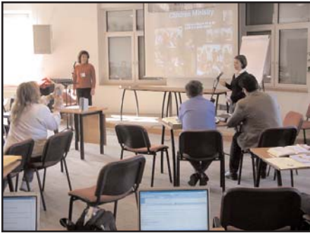
Giving our presentation at the Leadership Conference

them I haven't see since last February. It was so good being together again! I really enjoy being in their company. They are all wonderful people. It was so encouraging again to hear how God's working through them in each country — the changed lives, the events that made differences and the Kingdom that is being built. The last night, sharing the devotion and the Lord's Supper together, was so touching and intimate. To realize again that Jesus knows my name and he died for me, so I can live. It is breathtaking every time for me.