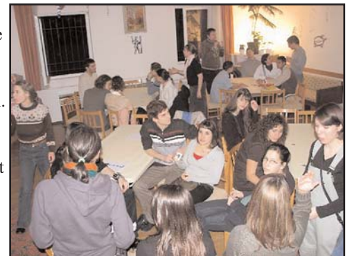
At the Building Party

of the party. There were around 60 young kids and we had so much fun on that evening. There was a quiz about how much we know about our church. It included topics like when it was built, how many people it can fit, who does the children ministry, who is doing the housekeeping, and how much we know about each other. They had to recognize church members and building parts from photos, and things like that. This evening brought back so many memories, as I almost grew up here.