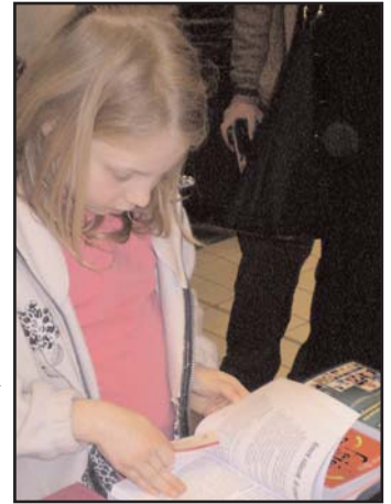
Our youngest reader at the Book Fair

In these last months I watched my kids in the Christian classes and in the youth group grow wonderfully. It is a privilege for me to see them in this process. In the primary school yesterday I taught about how Jesus fed 5,000 men with five loaves of bread and two fish. They all listened eagerly. And I really saw in their eyes how they were impressed by His miracle. We talked about the fact that we didn't need to worry about anything, because Jesus cares about everything, not just what our soul needs (the teaching) but also what our body needs (the food). And they all looked so convinced!