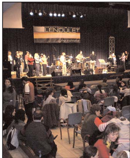
At the Drive Conference

Praise God we have outgrown our church, the rooms we have and the church itself are not enough for that many people. So this spring we are starting a church expansion. That brought the idea for the topic